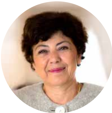
Monique Barbut UNCCD

Up until 200 years ago, land use change and land degradation were localized and inconsequential when compared with contemporary changes in the Earth system. However, the capacity of land and soil to absorb the cumulative impacts of intensive human activities is now being severely tested. Worldwide, between 20-30% of our croplands are considered to be moderately or severely degraded mainly as a result of poor management practices. Each year about 12 million hectares of productive land are lost or abandoned due to soil erosion and land degradation processes.