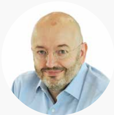
Peter Bakker WBCSD

Connecting landscapes with vegetation buffers is actually about connecting people: landholders, community members, local governments, natural resource management experts and importantly, providers of finance and the private sector.